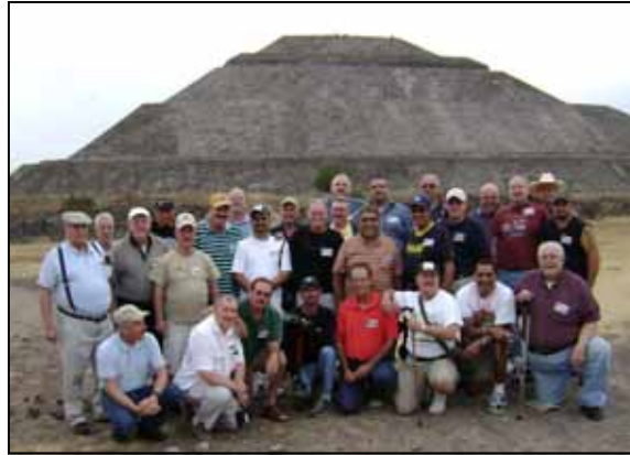
RGV Group visits Pyramid of the Sun at Teotihuacan

"The process of sponsoring a member from the local Chapter is simple. The Nominee should approach his Chapter Board and ask for approval to serve on the Worldwide Board. The Chapter Board should check the Nominee's status in the Chapter (paid dues and other compliance with local Chapter By-Laws.) The President shall then draft a letter to the Worldwide Nominating Committee (not yet formed) naming the Nominee, the Board position he is running for, that he is in good standing with the Chapter, and that the Chapter wishes to place his name on the slate. The Nominee should also send a letter to the Nominating Committee stating why he wishes to serve and why his experiences have prepared him to be a good candidate for the position. If there are two candidates nominated for any one position, the qualification letters from each candidate shall be distributed along with the Nominating Committee's list of nominations to all local Chapters on August 15, 2009".