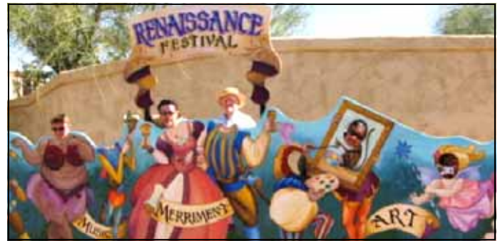
Tucson Prime Timers share a moment of fun during a day trip to the Arizona Renaissance Festival in March

It's actually too early to plan November or December, right now. Somewhere in there I'm looking forward to meeting and getting to know many more of you. If you see a spot in there for us to get together, just be me a 'holler'. If I can make it I'll be there!