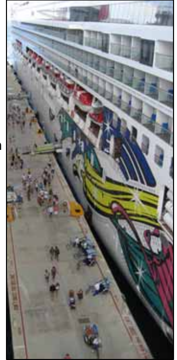
A view of the Norwegian Jewel. Look at all the verandahs!

We are still planning our 2010 Repositioning Cruise. Most people have asked for a Fall date (sailing from Europe to Florida) but it is too early for the cruise lines to release prices and agendas. As soon as Courtyard Travel has this information we'll pass it right on to you.