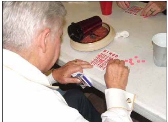
CHARLOTTE: Our January White Elephant Bingo meeting was an incredible success. An amazing array of prizes, a couple of multiple winners, and a great deal of fun was a nice way to start off the new year. There were a great many games because of the amount of prizes and he worked virtually non-stop.