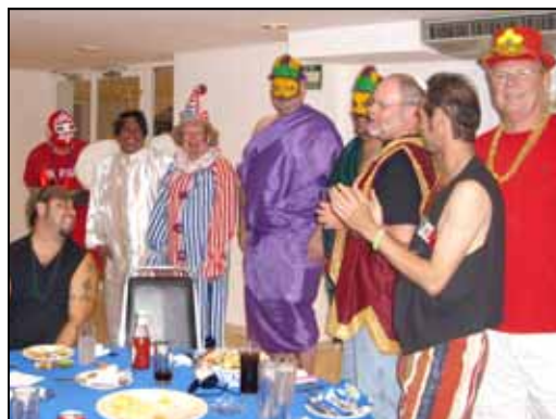
Costume party in Veracruz

The beautiful ancient pyramids of the lost tribes were only outshined