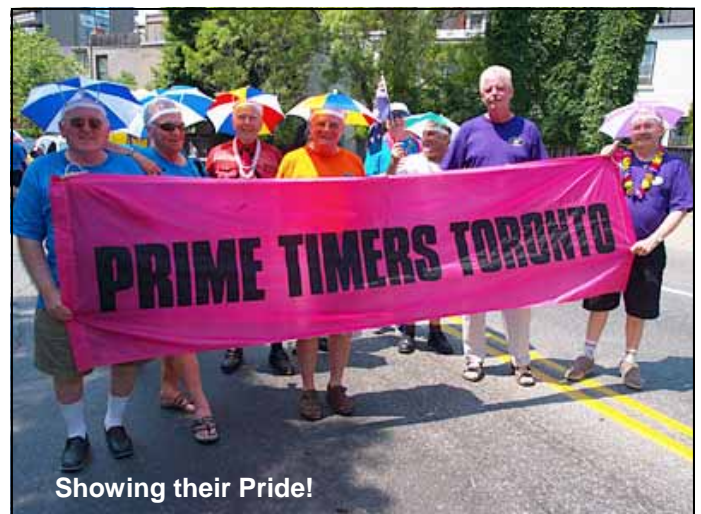
Showing their Pride!