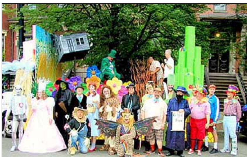
Boston's Pride Float "Over the Rainbow Not Over the Hill"

There isn't enough room in this memo to thank and appreciate all the float personnel and walkers who completed the most important aspect of the whole production: "Over