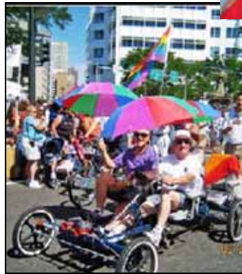
Colorado Prime Timers "float" (above) and booth (right)