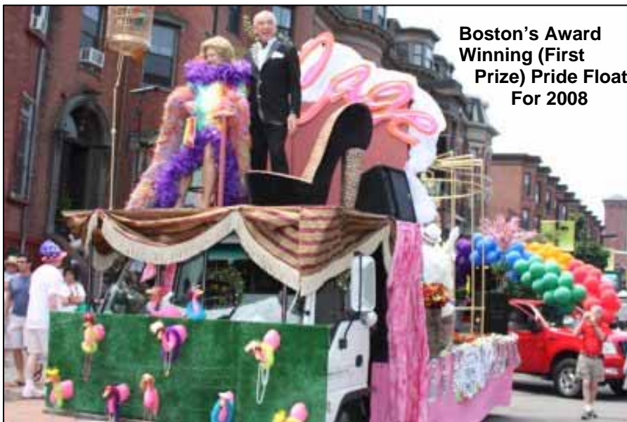
Boston's Award Winning (First Prize) Pride Float For 2008

The do plan on marching in this years parade, so if you are in Boston for gay pride, consider joining them.