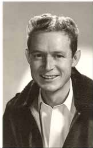
A Young Man