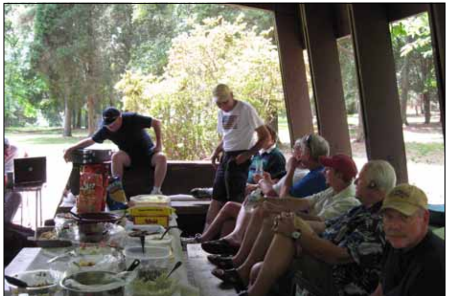
Charlotte members resting after the big lunch

booked the same shelter for 2010 so look forward to everyone returning then.