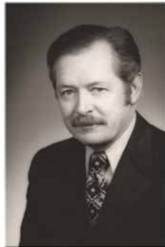
A College Professor